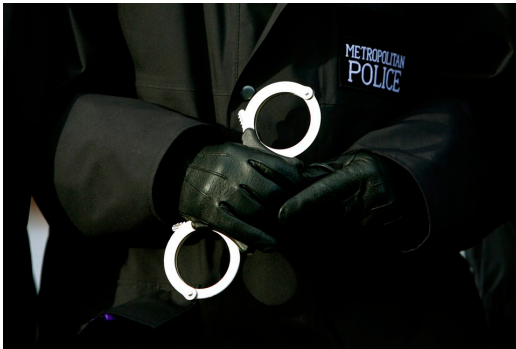
The Pre-Terrorists Among Us