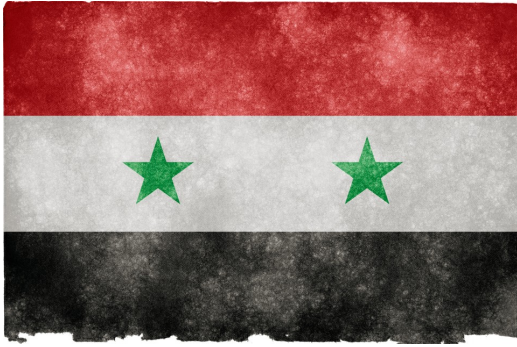
The Confused Person's Guide to the Syrian Civil War

ISIS to be al-Qaeda's weaker partner. "If a jayvee team puts on Lakers uniforms that doesn't make them Kobe Bryant," the president said.